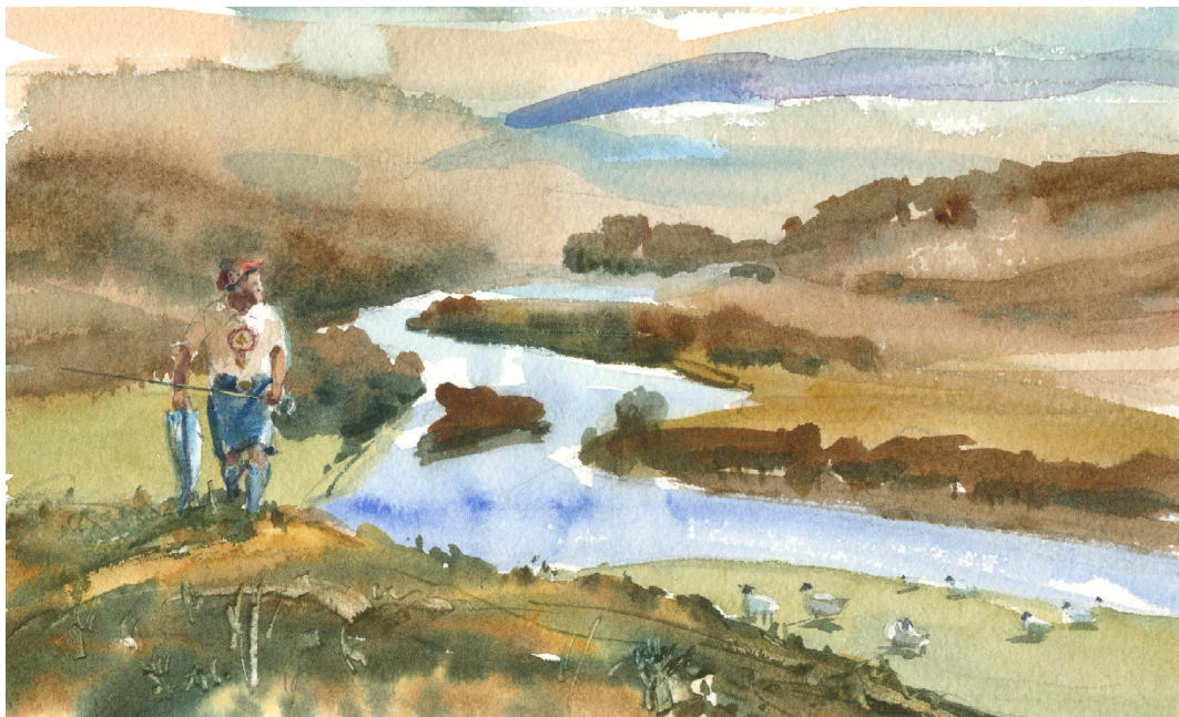
Above, a study for “Poached Salmon.”

Below, detail from the final painting. The original painting has been donated to the 2006 Highland Games, along with three prints. The original and prints will go at auction, with a major portion of the proceeds providing funds for the Texas Children’s Hospital.