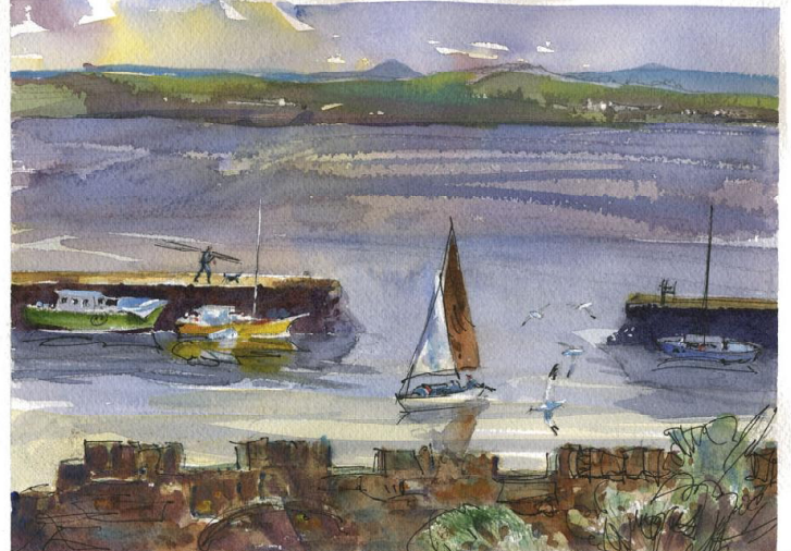
Four studies of various favorite places in Scotland. Upper left, near Broom Hall in the 1850's. Upper right, leaping salmon on the Crathie Beat, just below the Brig O' Dee. The bottom two studies are views of the Firth of Forth, looking from Elgin House Hotel.